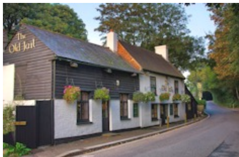
The Old Jail, Biggin Hill.