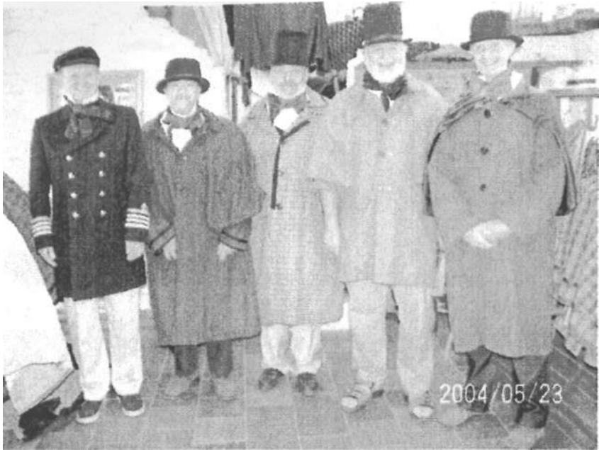
What a fine bunch of men!!. Dressing up in old clothes at Morwelham.