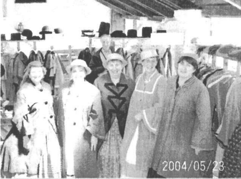
Lovely ladies at Morwelham all dressed up with no where to go.