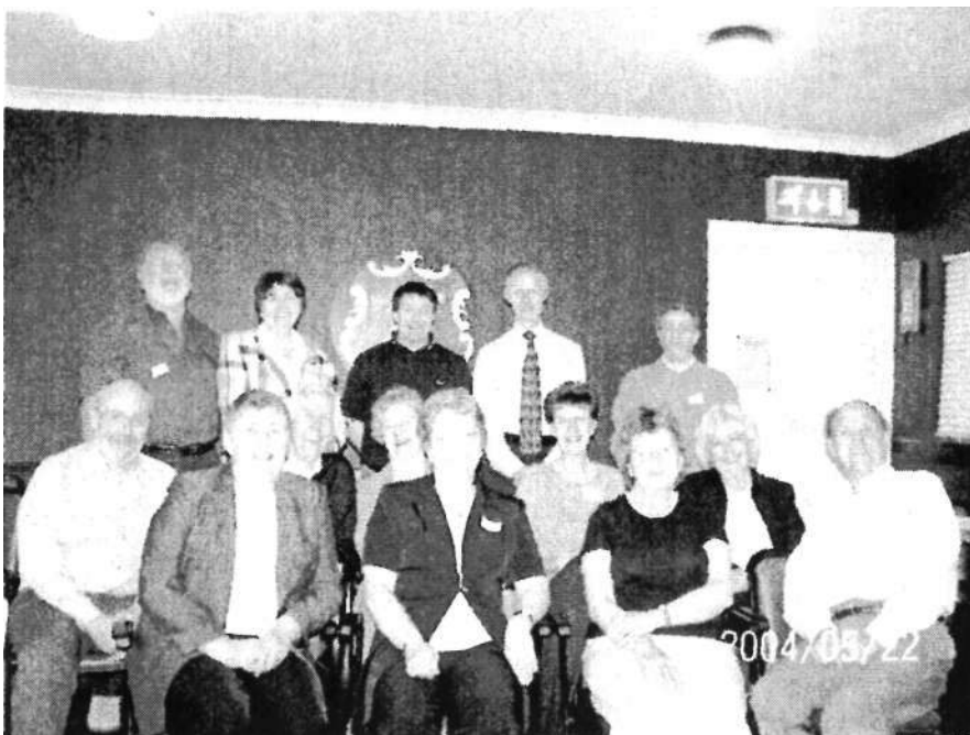
Photo taken in the Rundle room Tavistock Town Hall May 2004.